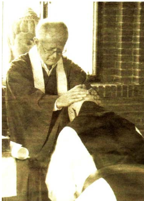
“Trappist” priest being installed as teacher of Zen Buddhism by a “Jesuit”