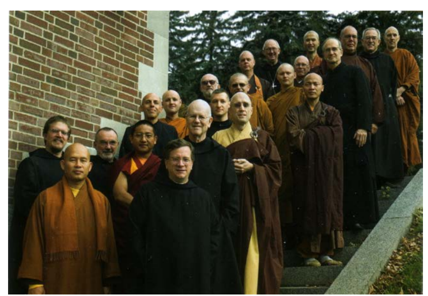
Novus Ordo "Benedictines" at the "Monks in the West" Conference with Buddhists<sup>2</sup>

"We devoted two full days to sharing our personal spiritual journeys... attending the Buddhist community's chanting services, meditating together and enjoying superb Chinese vegetarian cuisine." 1